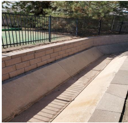
Retaining Wall $26,500 (replaced rotting railroad ties)