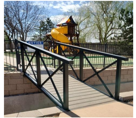
Bridge $3,695 (replaced rotting wood & broken rails)

An active HOA is important in order to protect the property values of our homes. The Braden Park Board ensures that the common areas, including the Amenities, Landscaping, Gates, Streets, etc. are regularly maintained and repaired.